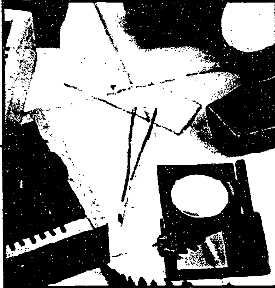
Figure 1 PICTURE WHICH IS THE BASIS OF ANALYSIS IN FIGURE 2